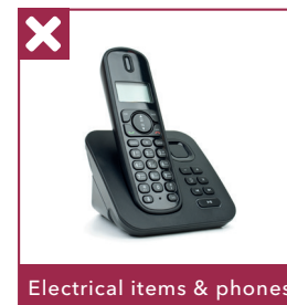
Electrical items & phones

If you are uncertain about what you can or can't shred please call 0800 028 1164 for help, advice and further information.