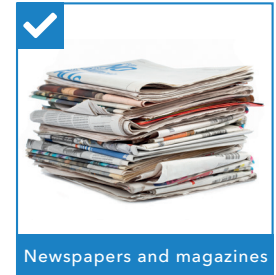
Newspapers and magazines

Staples and paper clips are also ok to include