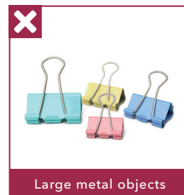
Large metal objects