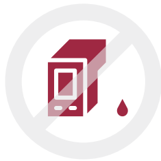
X Ink cartridges