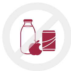
X Food, glass, cans, gum, etc.