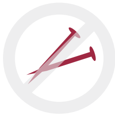
X Sharp objects