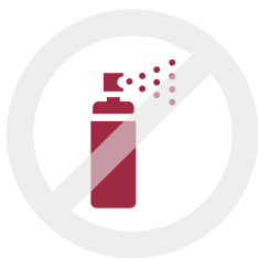
X Pressurised containers