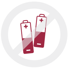
X Batteries of any type

If you are uncertain about what media items you can or can't shred please contact us for advice.