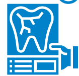
Microfiche and X-rays