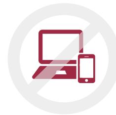
X Electrical items & phones

For more information visit shredit.co.uk or call 0800 028 1164