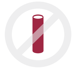
X Cardboard tubes